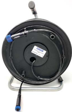
100m cable on a reel.

Our packages come complete with a 3m cable. If you need additional length we have 10m, 20m and 30m length options. Custom lengths are also available on request.