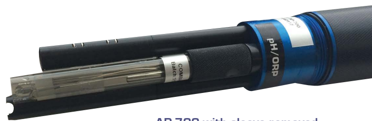
AP-700 with sleeve removed

Both the AP-700 and AP-800 can have the DO sensor upgraded to our optical dissolved oxygen sensor. Both probes can also have a depth sensor fitted at time of order.