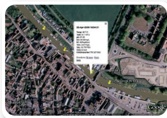
GPS data sets viewed in Google Maps and Google Earth