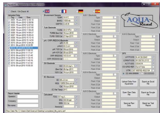
AquaLink and Google Earth screen shots